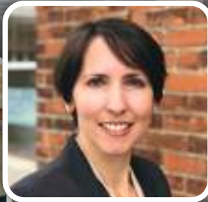
Narrator: DEBORAH ROGERS Mayor of Williamsville