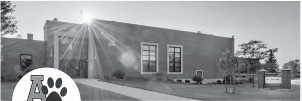
SMALLWOOD DRIVE ELEMENTARY SCHOOL